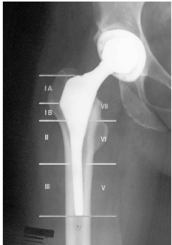
Fig. 2 Gruen zones. The zone I was divided into IA and IB, above and below the outermost tip of the lateral flare

To limit measurement error due to patient positioning variations, the patient's leg was placed in neutral rotation and secured to