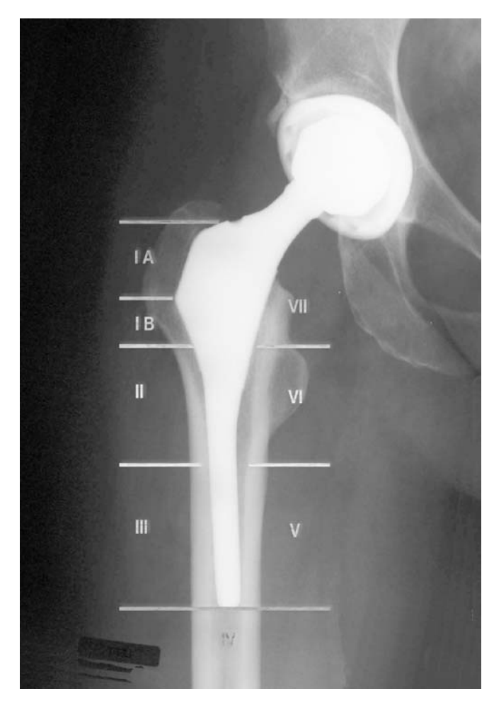
Fig. 2 Gruen zones. The zone I was divided into IA and IB, above and below the outermost tip of the lateral flare

To limit measurement error due to patient positioning variations, the patient's leg was placed in neutral rotation and secured to